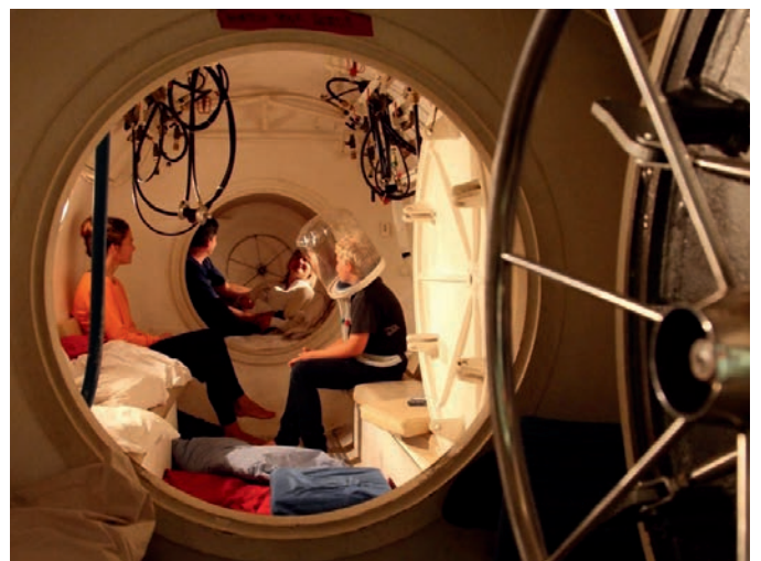
Inside our hyperbaric chamber which can hold up to 20 children